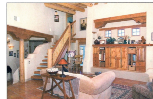
The home features oversized windows for exceptional viewing, saltillo floor tiles throughout and pine ceilings.