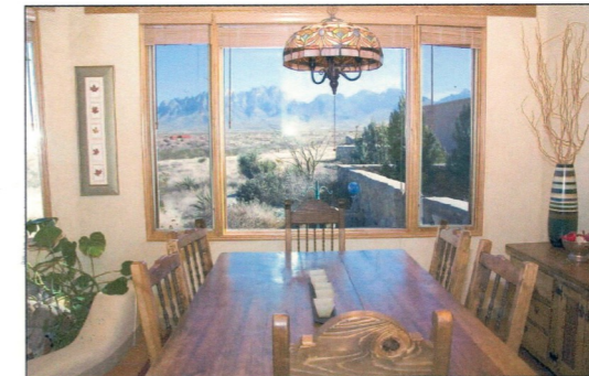
A view of the Organ Mountains and desert scenery lend character to the dining room, while an indoor pond brings a bit of the outdoors in.