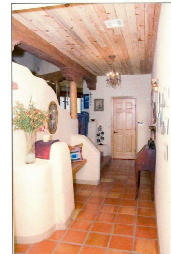
With its unique floor plan, the home's master suite, bedrooms and sunken office are on one end of the main hallway, while the living room, dining room and kitchen are on a slightly higher level.