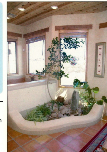
Inspired by the family's love for fishing, the indoor pond is one of the family's favorite elements in the house.