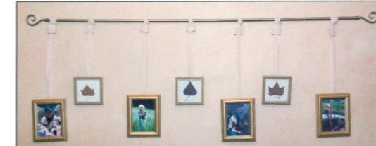
Kiki Suggs custom designed this photo display using framed photos, a curtain rod and ribbon. It hangs in the couple's master bedroom.