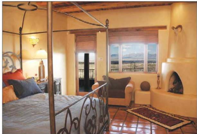
The master bedroom includes a door to the patio, which leads to a hot tub.