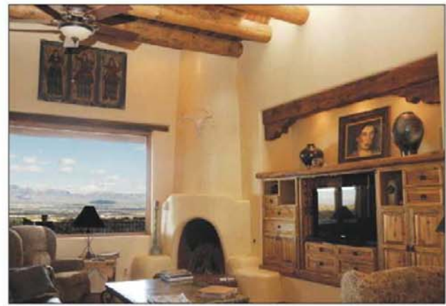
Reclaimed wildfire pine decorates the living room, which contains one of the home's four fireplaces.

With Picacho Peak as its backdrop, this home also has a view of the Organ Mountains.