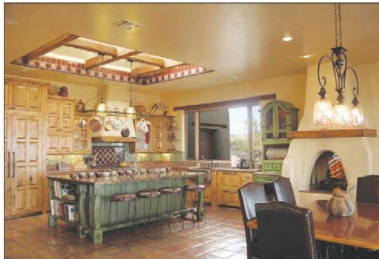
The kitchen color scheme was inspired by pottery created by local artist Russell Mott.