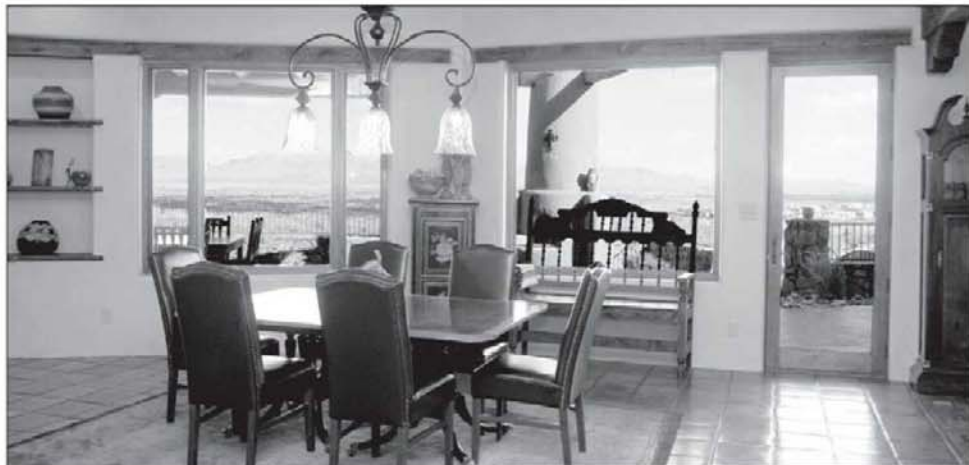
Large windows surround the house to bring in the view and natural light, a feature that was important to the owners.