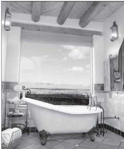
This claw-foot tub offers the perfect place to unwind.